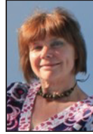
Clerk to the Parish Council